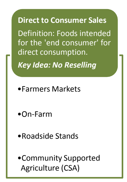
Figure 3 Direct to Consumer Summary

This is generally thought of as locally grown or produced foods being sold to local food consumers through outlets such as farmer's markets, roadside stands, on-farm sales and through Community Supported Agriculture (CSA) sales models. Although 'local' implies a geographical or regional relationship between food production and consumption, there is no definition on the distance food products travel to be considered local. The 2008 Food, Conservation, and Energy Act which the U.S. Congress adopted, defined the total distance traveled for a "locally or regionally produced agricultural food product "to still be